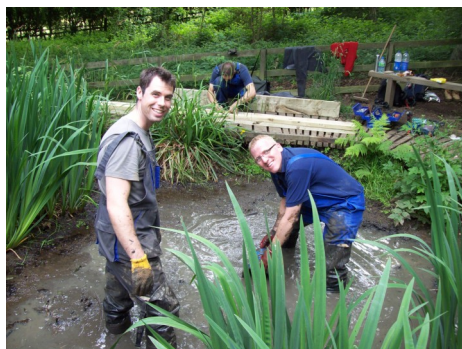
repairing a pond in a Primary School's Wildlife area.

Work ranged from helping manage footpaths on the Steel Valley Walk, installing gates on the Isle of Skye, Hunshef and even