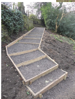
Above and left: